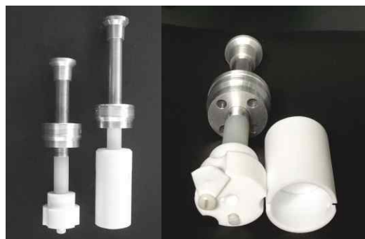
Include Bulk & Single Seed Sample-holders.