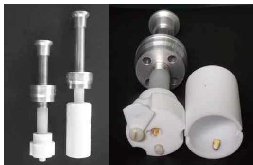
Include Bulk & Single Seed Sample-holders.